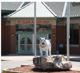
School Transportation Safety!

The City, MODOT, Franklin County, and the RXIII School District are working together in a joint effort to make necessary improvements to the intersections of Highway 30 at Bardot and High School Drive. This project is also scheduled to kick off and be completed in 2012.