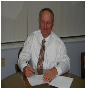
Mayor Ron Blum